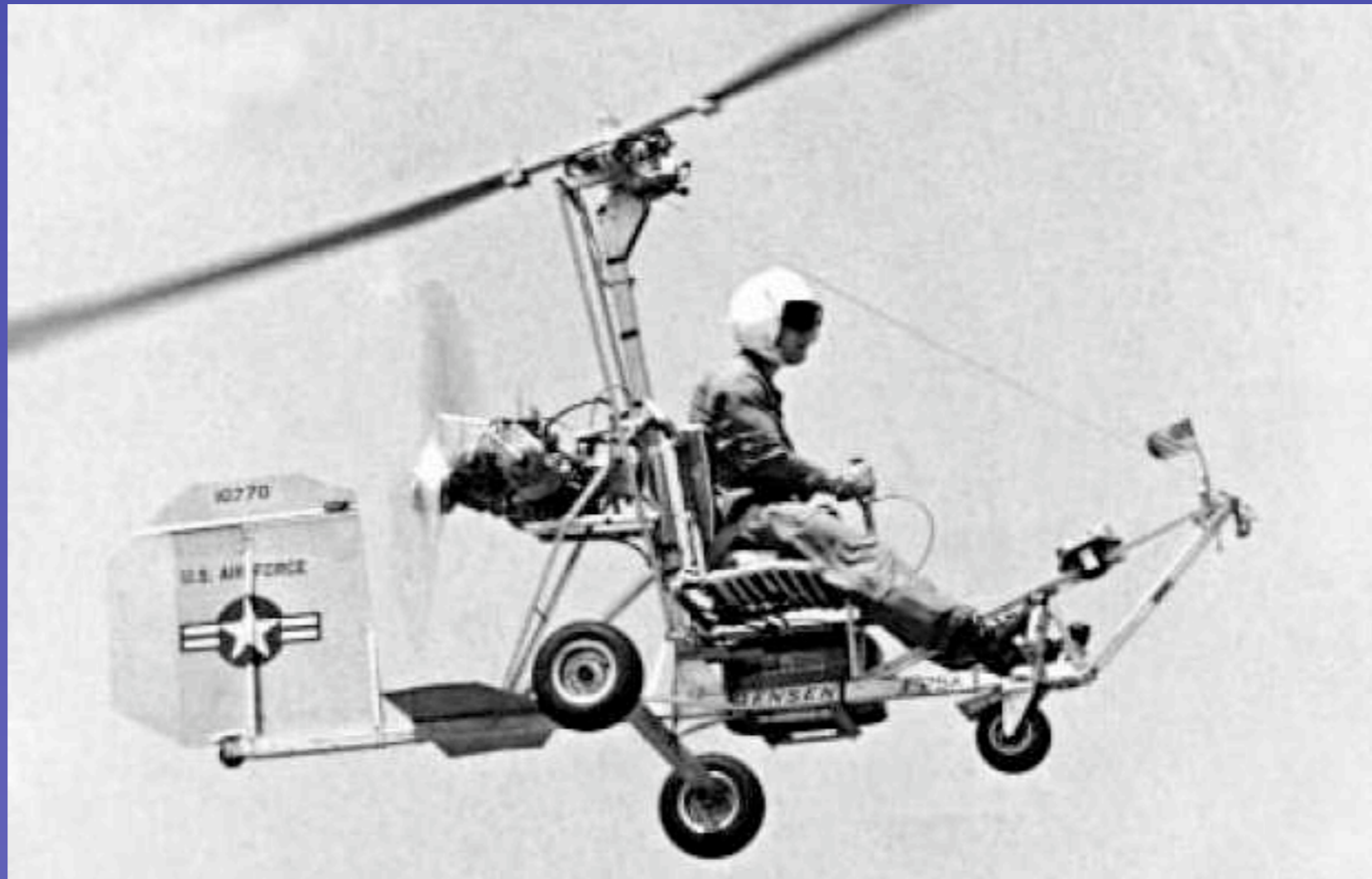
An X-25 Gyrocopter