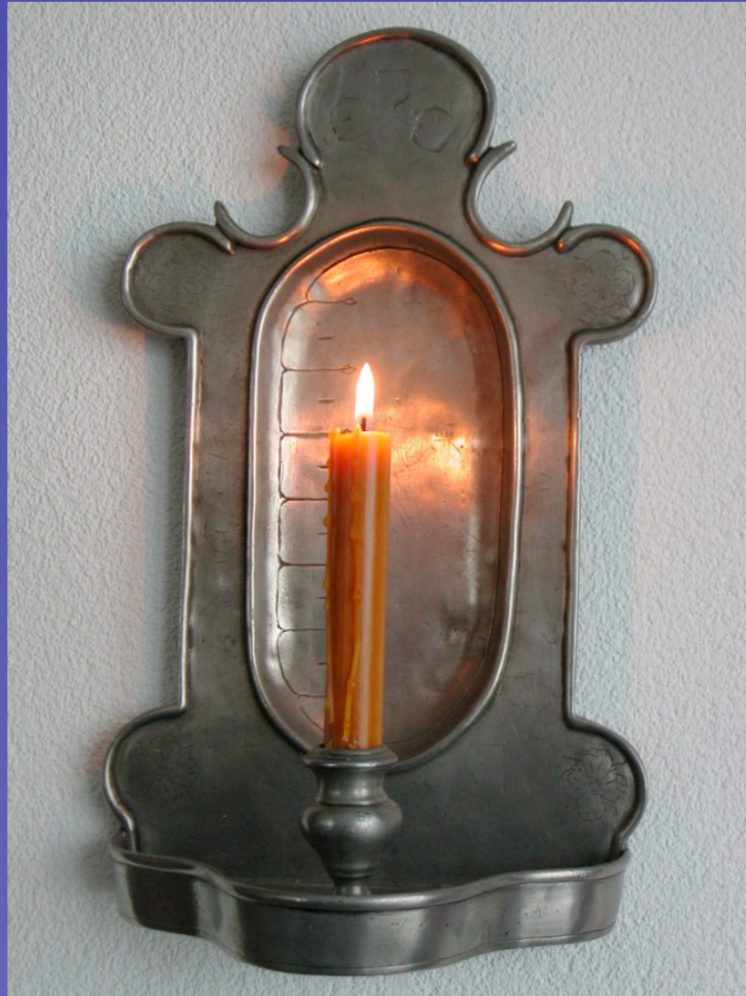
A candle clock